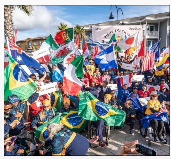
ISA Para Surfing World Championships Opening Ceremony 2022

The Greek word 'para' means parallel, signifying that the Paralympics operates tandem with its able-bodied counterpart, the Olympics. Together, the Olympic and Paralympic Games stand out as one of the world's and highly prestigious anticipated sporting events, gathering elite athletes from around the globe. Held every four years in the same host city, these events are unparalleled in scale and scope attracting millions of viewers generating enormous excitement and national pride.